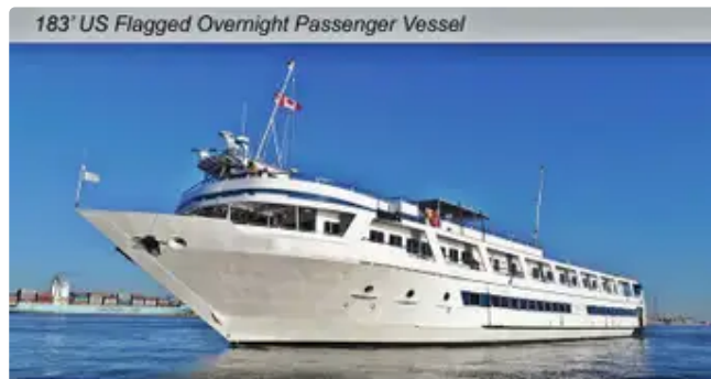
183' US Flagged Overnight Passenger Vessel